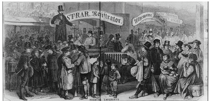
Castle Gardens 1840

and Immigration Services website at http://www.uscis.gov where you find a link under "services" offering a whole section on "History and Genealogy."